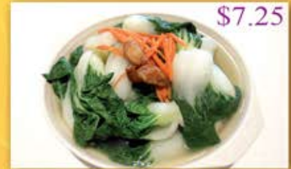
上湯浸白菜苗 Baby Bok Choy with Supreme Broth