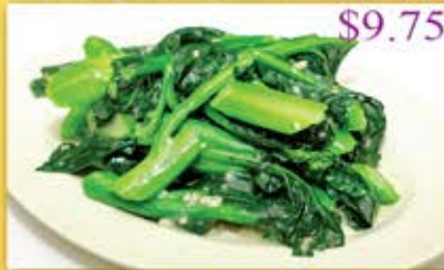
蒜蓉芥蘭 (點心) Sauteed Chinese Broccoli (GaiLan) with Garlic (DimSum)