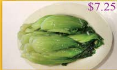
蒜蓉小唐菜 (點心) Sauteed Bok Choy with Garlic (DimSum)