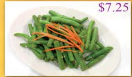
蒜蓉炒鮮四季豆 (點心) Sauteed Fresh Green Beans Stir-fried with Garlic (DimSum)