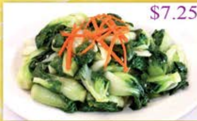
蒜蓉白菜苗 (點心) Baby Bok Choy Stir-fried with Garlic (DimSum)