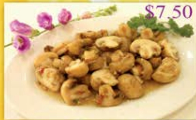
蒜香牛油爆蘑菇配煙肉蓉 Sauteed Mushroom, and Bacon Bits Stir-fried with Garlic and Butter