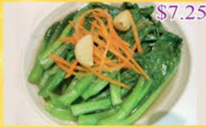
上湯浸油菜心 You Choy Sum with Supreme Broth