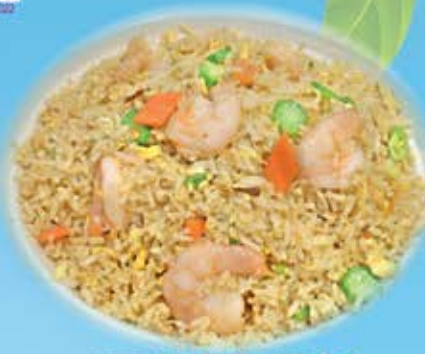
XO醬大蝦炒飯 $17.75 Prawns Fried Rice in XO Chili Sauce