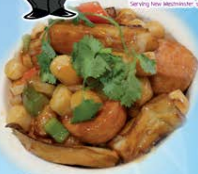
漁香三子煲 $17.95 Braised Scallop with Egg Tofu and Egg plant in Spicy Bean Sauce