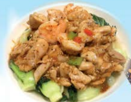
黑椒龍鳳白菜苗 $16.50 Prawns and Chicken with Baby Bok Choy in Black Pepper Sauce