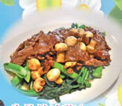
牛片炒油菜心 $16.50 Beef Slices Stir-fried with Yoo Choy Sum and Mushroom