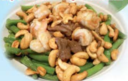
腰果蝦球牛肉炒四季豆 $16.75 Prawns and Beef Stir-fried with Cashew Nuts and Green Beans

實物或與圖片有所不同 Dishes served may be different from Pictures shown