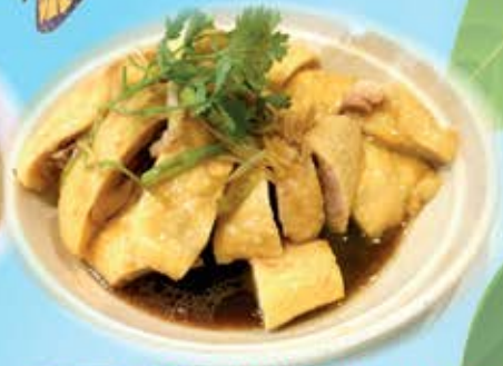
薑蔥豉油走地雞 $16.95 Free Range Chicken in Special Soy Sauce with Ginger and Onion