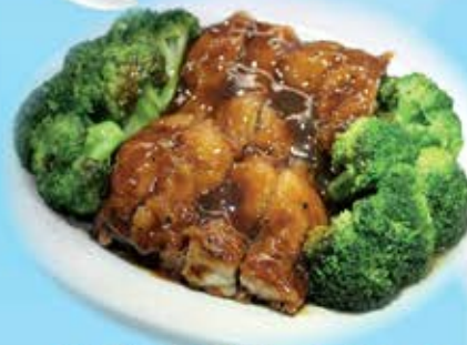
黑椒煎雞排 $14.95 Deep-fried Chicken with Black Pepper Sauce & Broccoli