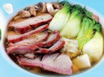
錦繡窩雲吞 $14.50 Wor Wun-tun